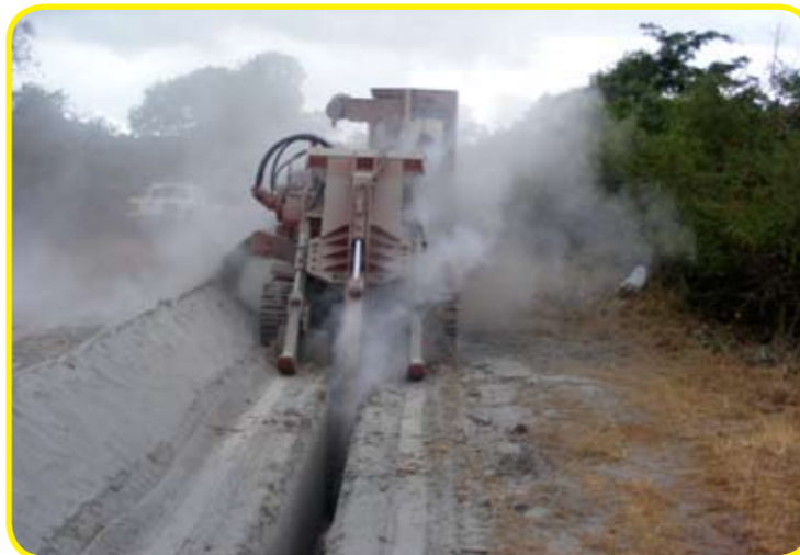
Soliton Rock Trencher at work